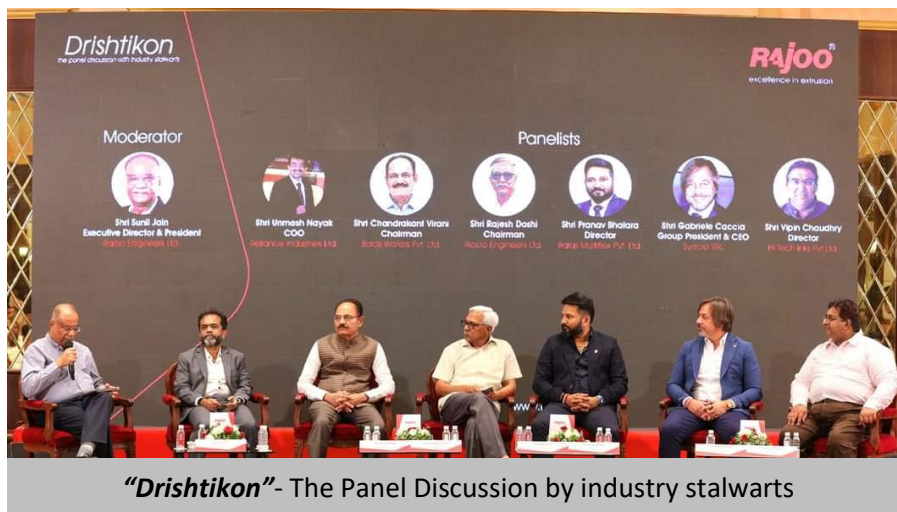
"Drishtikon"- The Panel Discussion by industry stalwarts

Rajoo Engineers hosted an exclusive, invite-only event on the 4th and 5th of July, 2024, bringing together the processors, innovators & leaders of the flexible packaging industry. This prestigious event was held in Rajkot, India and featured a blend of cultural and industry-focused activities, catering to a global audience.